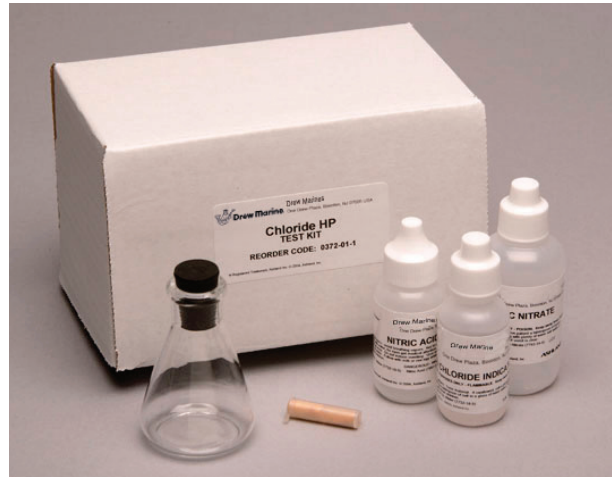
Chloride HP Test Kit (Range 1-16 ppm Chloride) PCN 0372011