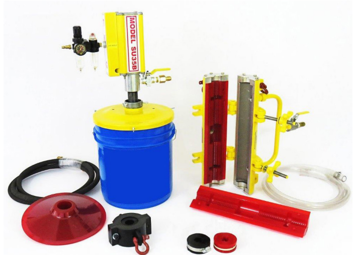
Standard System, model SU35B (PCN 1AA2477)

Kirkpatrick Wire Rope Lubrication Systems come in two basic configurations: Standard for wire rope sizes 1/8" (4/5MM) to 1-7/8" (48MM) and Jumbo for wire rope sizes 3/8" (9/10MM) to 3-7/8" (98MM).