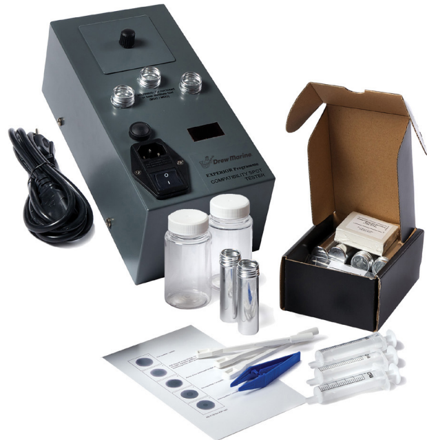
DREW XP COMPATIBILITY TESTER

Whether a single fuel is inherently unstable or two mixed fuel oils are incompatible, sludge formation is the likely result. And for operators without timely access to reliable data about unstable or incompatible fuel oils before using or mixing them, overloaded centrifuges and choked fuel filters are often the first indicators of fuel oil sludge problems. More severe problems can lead to plant shutdown due to reduced fuel oil supply to engines or boilers.