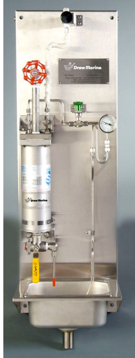
PCN 1AA9111 (LP) - up to 34 bar (shown) PCN 1AA9112 (HP) - up to 209 bar