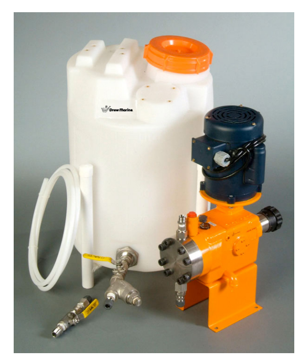
DREW Promus Metering System (PCN 1AA8980)

Power Supply: 115/208 – 230 VAC; 1 ph; 60 Hz Maximum Amps: 8.4/4.1- 4.2 Tank Capacity: 60 liters (15.85 gallons) Tubing: 10 meters, flexible ½" PE Pressure: 140 Bar (2080 psig) Capacity: 7.6 L/h (2 G/h)